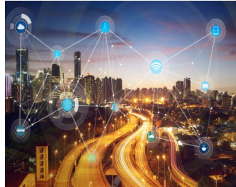
Smart Cities Mega-Challenge